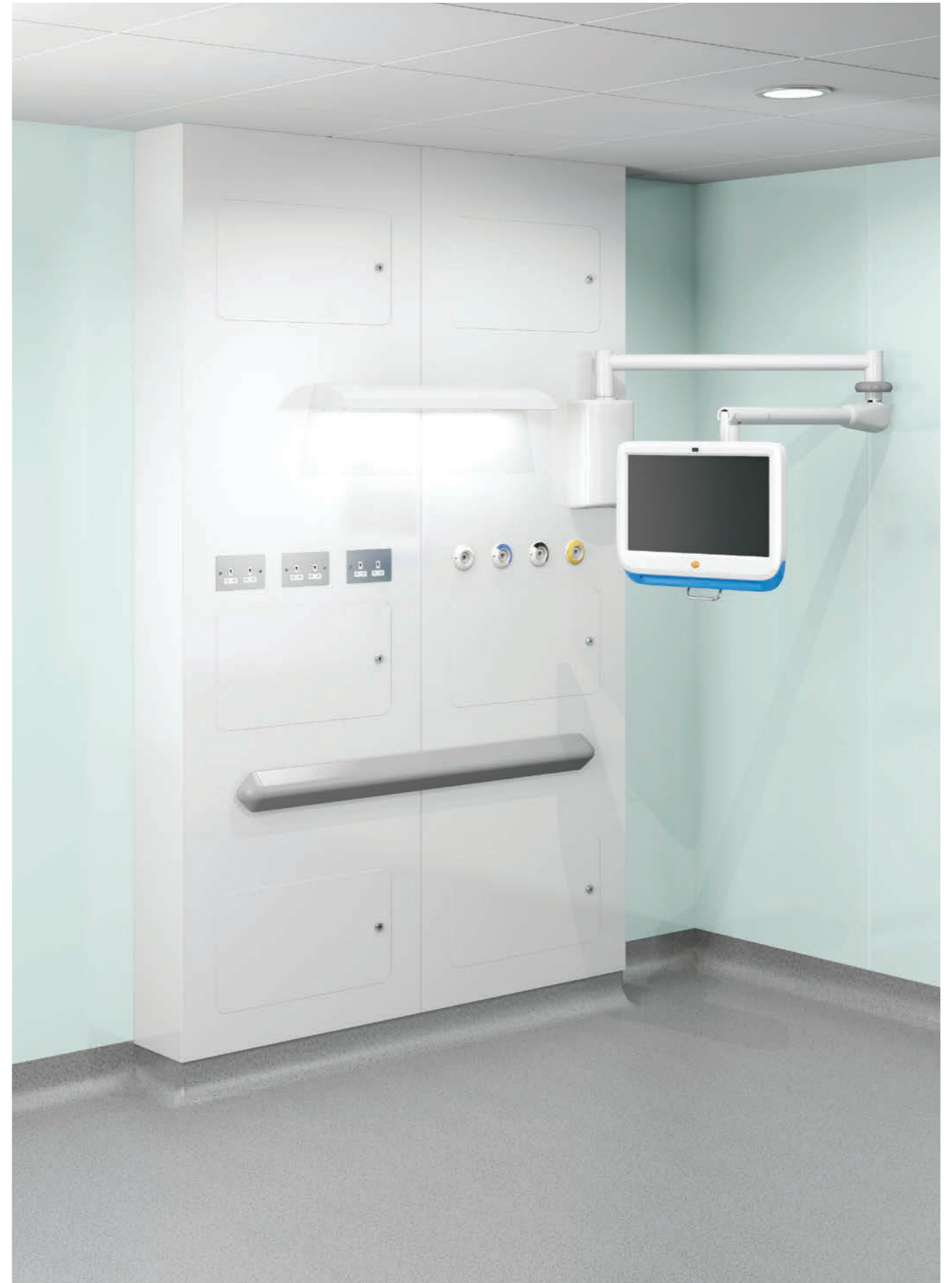
Bed Service Unit - Medical Service Units for out-patient departments also available