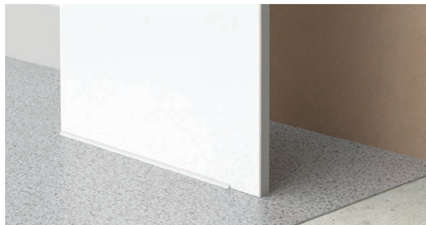
Direct to floor