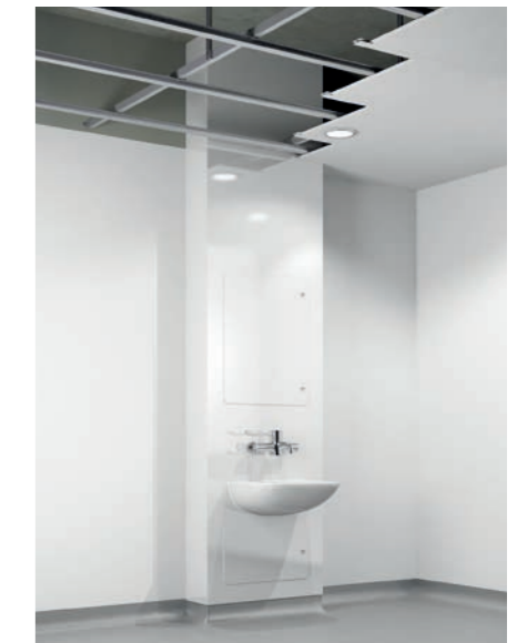
Through suspended ceiling