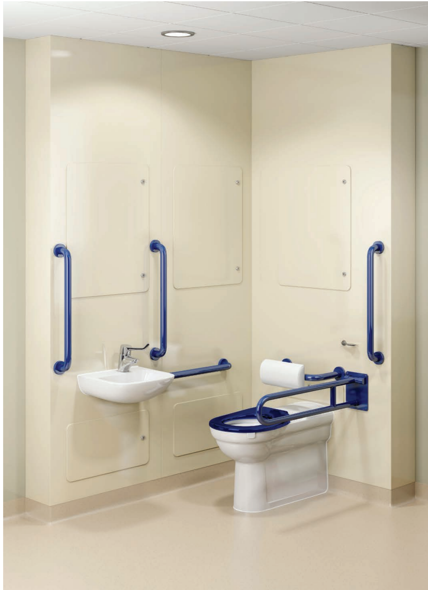
Doc M Unit