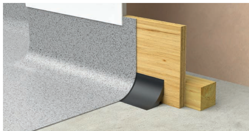
Plinth detail - pre-cut components supplied by Trovex