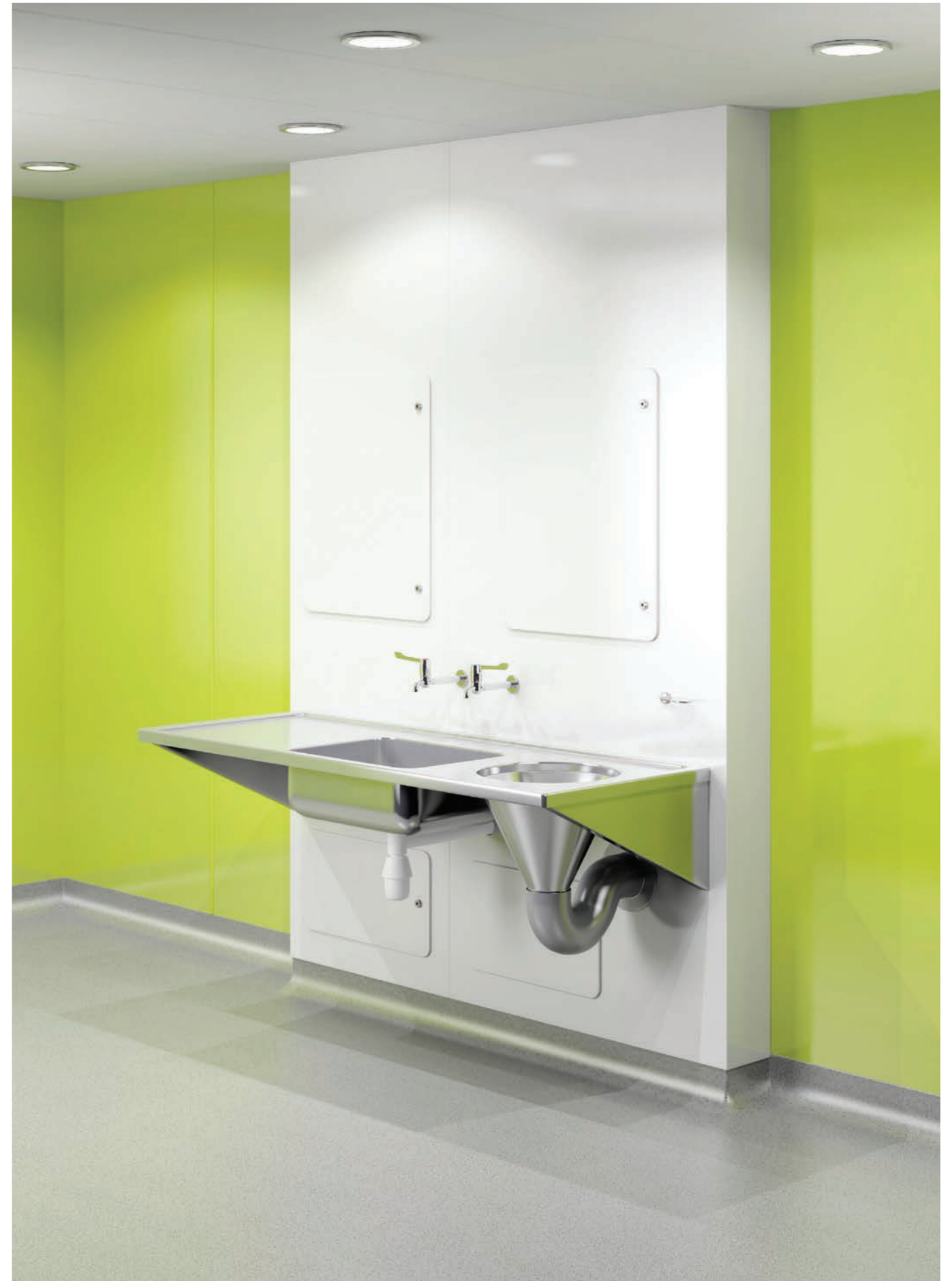
Sluice Unit - Janitorial Unit also available